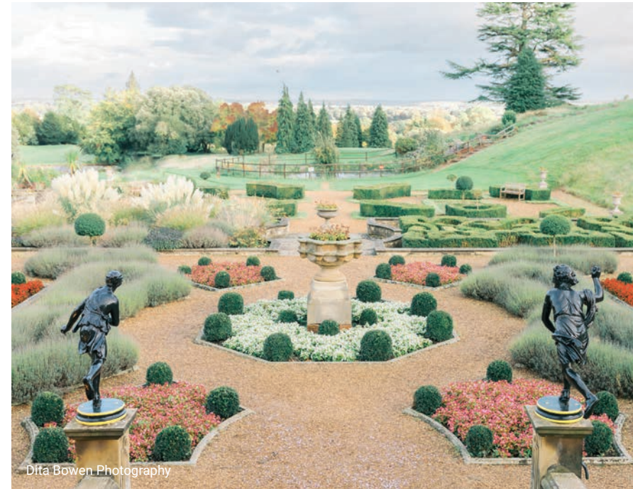
Difa Bowen Photography

Let yourself be swept away by this Neo-Jacobean country mansion full of character and grandeur. Located less than 2 miles from Stratford-upon-Avon town centre, we are the perfect base to explore Shakespeare's birthplace's abundance of tourist attractions. Host your special event in one of our 11 spaces, with a maximum capacity of 160 guests for a reception or 130 guests for a banquet. With 85 bedrooms including four poster suites and seven apartments, The Welcombe Spa, The Welcombe Golf Course, The Trevelyan Restaurant and Bar and Instaworthy gardens and grounds, we're the perfect all round venue for a variety of celebrations.